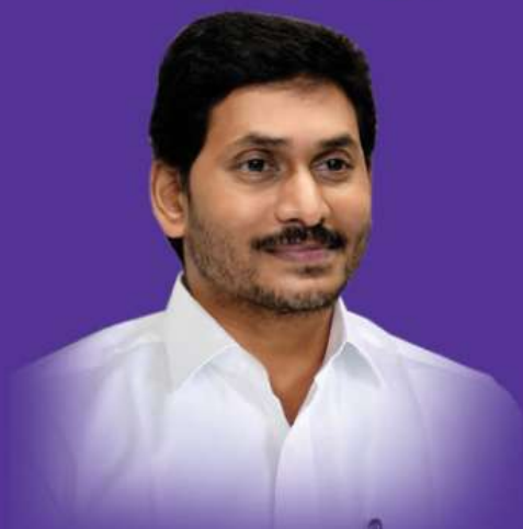
Shri. Y.S. JAGAN MOHAN REDDY Hon'ble Chief Minister of Andhra Pradesh